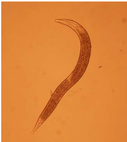
Figure 3: Infective juvenile of Steinernema feltiae from sample B30.

We can place mentioned species into » feltiae group« of nematodes from genus Steinernema (Nguyen, 2006); for infective juveniles it is known that they are between 1000 and 700 µm long (Fig. 3). This nematode lives in symbiosis with bacterium Xenorhabdus bovienii (Poinar, 1988). The nematode was first recorded in 1934, and its applicable value in biological control of insect pests is well known (Ebssa, 2001). Some researchers reported that S. feltiae , S. intermedium (or C1) and S. affine like to appear on agricultural land (Sturhan, 1996). In Europe, the occurrence of S. feltiae was up to now confirmed in Austria, Belgium, Great Britain, Czech Republic, Denmark (original), Estonia, Finland, France, Germany, Greece, Hungary, Ireland, Italy, Poland, Slovakia, Spain, Sweden, Switzerland, Netherlands, Norway, Ukraine, Bolgaria and Portugal (Hominick, 2002).