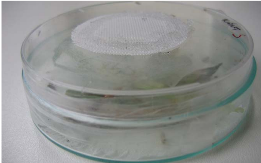
Figure 1: Experimental vessel made for investigation of non-target effect of entomopathogenic nematodes on green lacewings ( Chrysoperla carnea ) larvae. At the same type of vessels the rate of larval cannibalism was investigated.