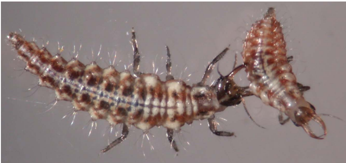
Figure 2: Cannibalism between green lacewing ( Chrysoperla carnea ) larvae. Bigger and elder larva consumed smaller conspecific larva.

lacewings larvae. The influence of EPN species and nematode concentration were not significant.