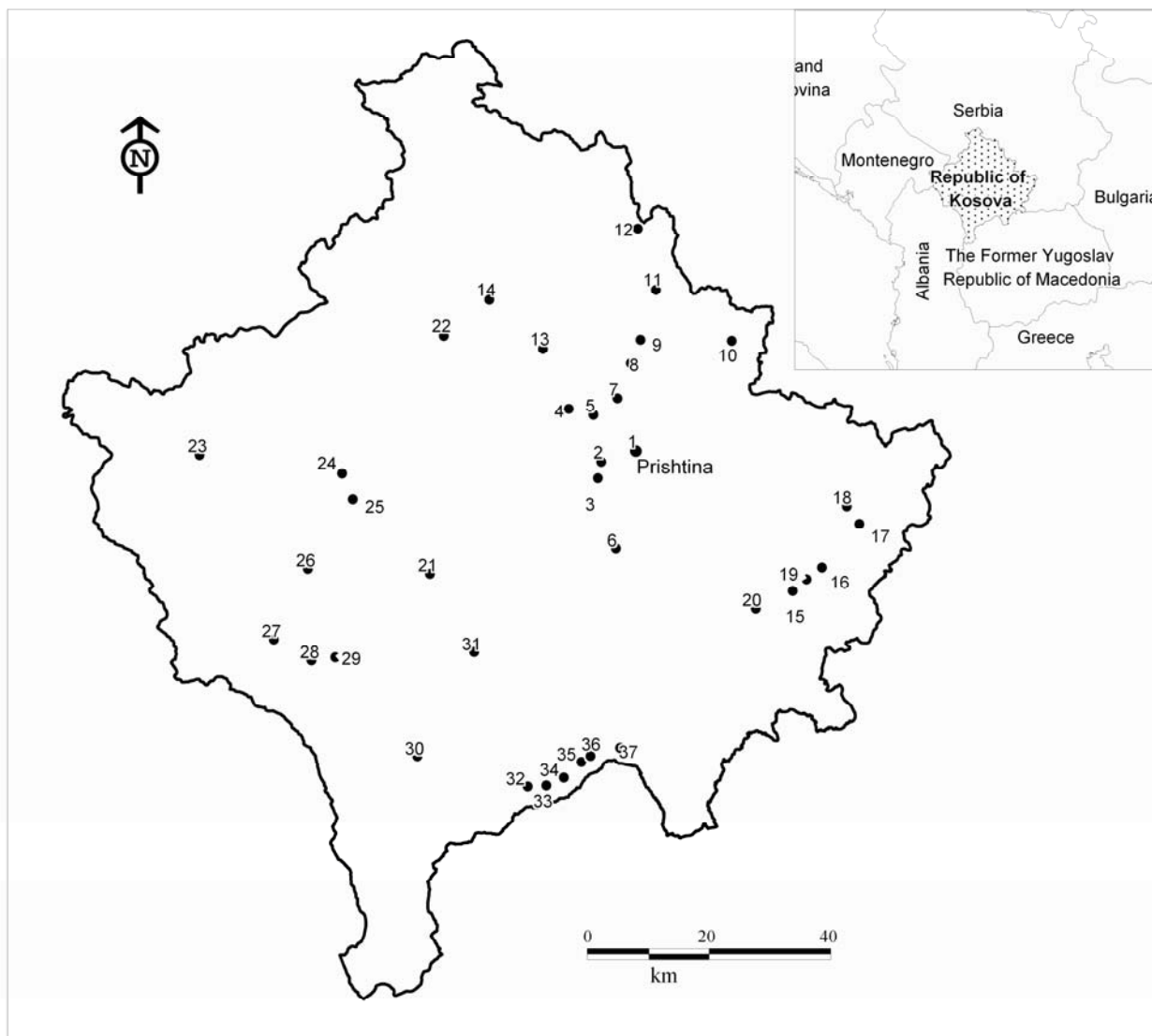
Fig.1. Localities in Kosovo where the investigated have been registered are as follows: 1 Gjilan - beside the road at the entrance of the city towards Prishtina, on a surface slightly turned towards the south, ( 12.VI.1990), 2 . Klina, beside the road which connects this settlement with the Prishtina – Peja motorway (10.VI.1990), 3 . Suhareka, near the main road at the centre of the settlement, 4 . Fushë-Kosova, near the main road at the outskirts of the settlement towards Prishtina (6.VI.1990). 5,7,12 , Prishtina, near the roads in the outskirts of city, ( 20,25, 30.VI.1990), 6 . Kamenica, near the road at the entrance of the settlement, on a slightly skewed surface, turned towards the east (12.VI.1990), 8, 11 , Podujeva, beside the road of settlement (7.VI.1990), 9 , Peja, beside the road, in the city centre (10.VI.1990), 10 . Kerpimeh (Podujeva), near the wall of an inhabited house at the centre of the village (7.VI.1990).

In Croatia (Marković-Gospodarić, 1965) as specific species of association Hordeetum murini are regarded: Hordeum murinum , Malva silvestris and Bromus sterilis whereas in Macedonia (Matvejeva,1982) distinguishes only Hordeum murinum . Also, in Croatia, (Marković-Gospodarić,1965) within the notes association two sub-associations are differentiated ( Arctium minus-Tripleurospermum inodorum and normal), whereas in